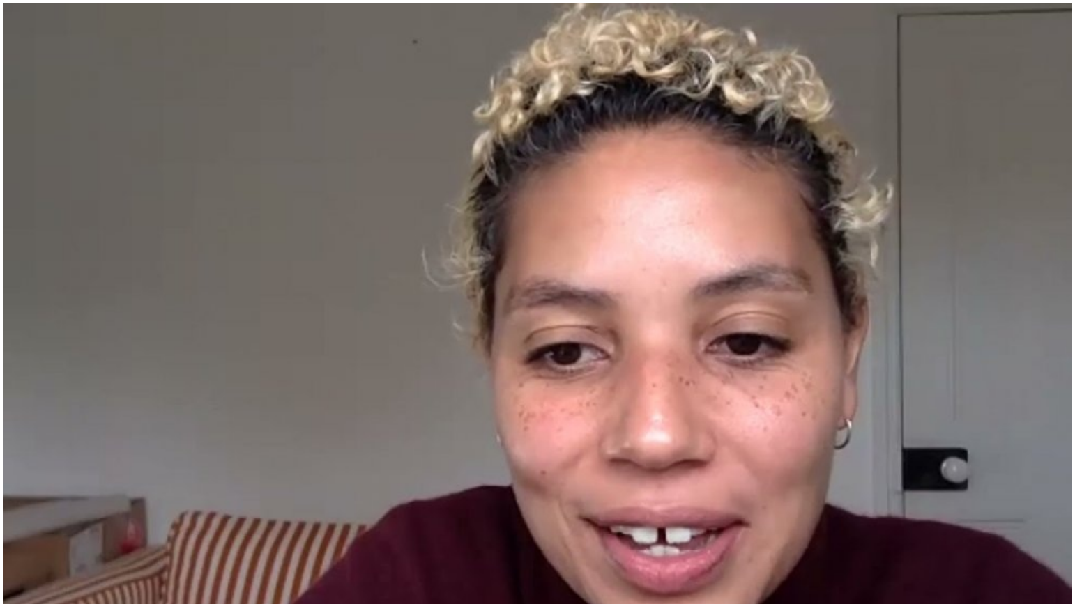
Roundtable #5: Coalition of trades unions and NGOs in the fight against climate crisis