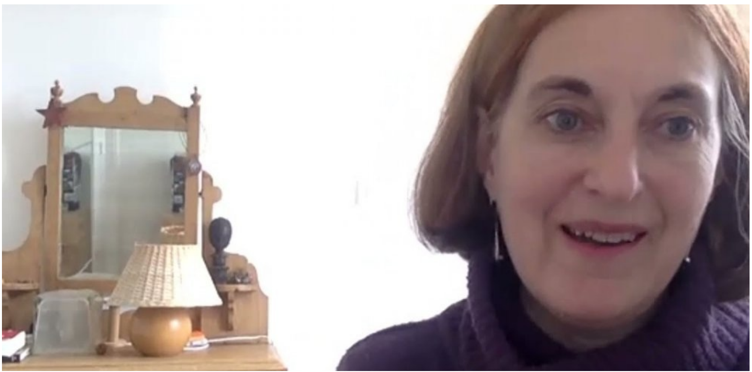
Roundtable #4: The French Example : Effects and consequences of the 35 hours 20 years after