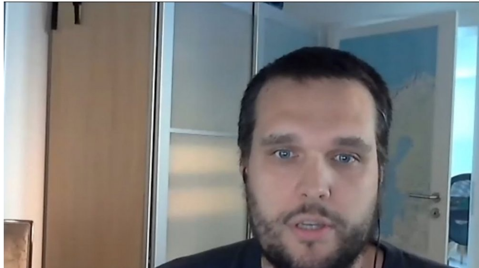
Roundtable #2: The place of the working time reduction in a post growth society